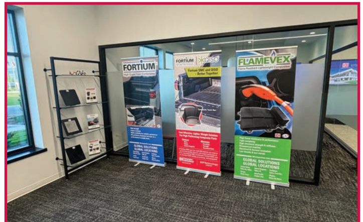
The IDI 3i Composites Technology Center

The IDI 3i Composites Technology Center is the research and development division of IDI Composites International. We generate and prove new ideas, approaches and materials to address the engineering and performance challenges of both our customers and the industry.