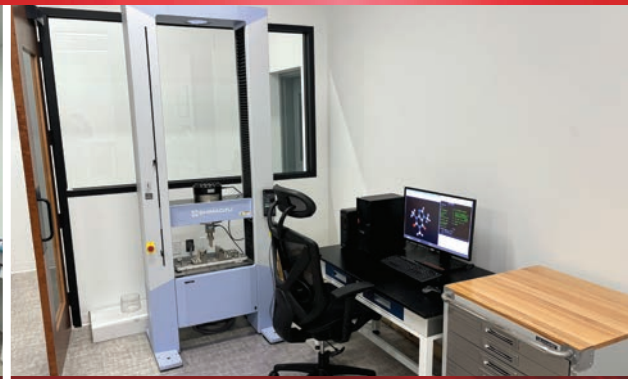
Part Prototyping And Testing