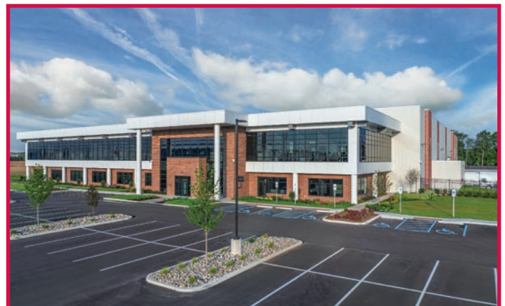
IDI Global Headquarters

The IDI 3i Composites Technology Center's mission is to design, develop and manufacture thermoset composite compounds for innovative customers seeking to go beyond the value limitations of conventional materials.