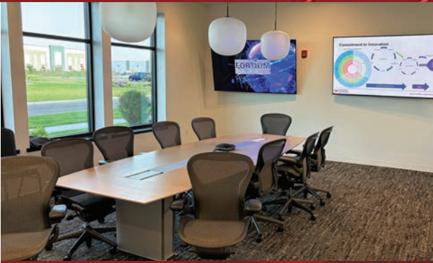
The 3i Composites Technology Conference Center