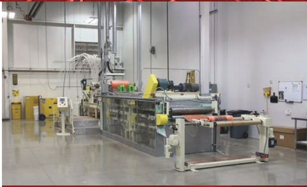
SMC Machine Customized For New Product Development